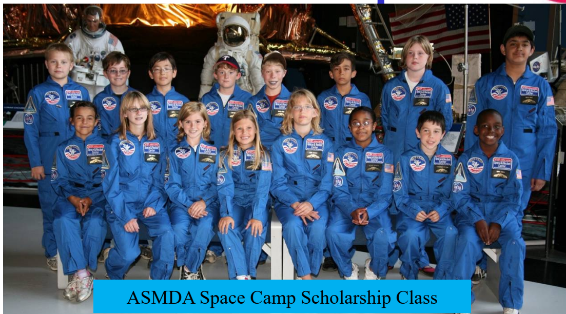
ASMDA Space Camp Scholarship Class

When: Sunday, 2 July 2023 – Friday, 7 July 2023