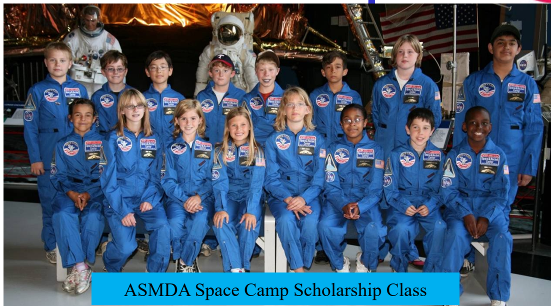
ASMDA Space Camp Scholarship Class

When: Sunday, 3 July 2022 – Friday, 8 July 2022