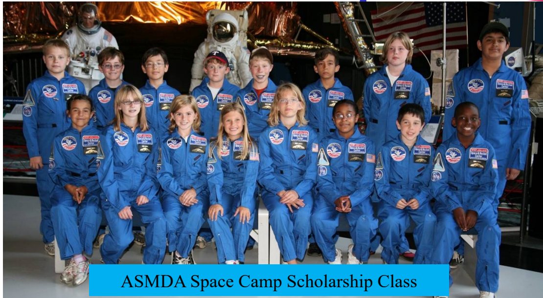
ASMDA Space Camp Scholarship Class

When: Sunday, 30 June 2024 – Friday, 5 July 2024